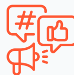
Social Media Management