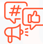
Social Media Management